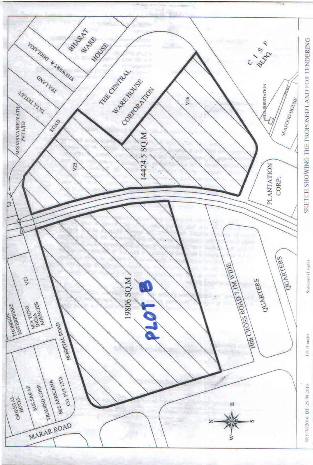
SKETCH SHOWING THE PROPOSED LAND FOR TENDERING