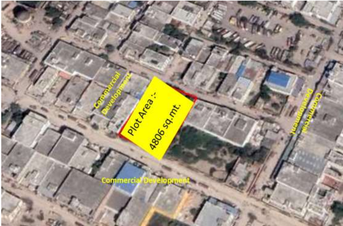
Location of Subject Site

The site is at a distance of 6 Km from NH 30, 6 Km from Manak Nagar railway station, 1.4 Km from the nearest metro station and 2.5 Km from Chaudhary Charan Singh International Airport.