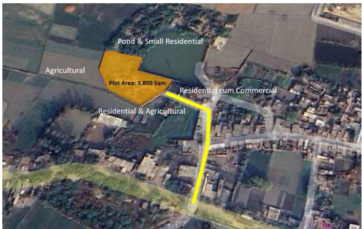
Location of Subject Site

The subject site is situated in the Machhalishahar, a city and Tehsil Headquarter in the Jaunpur district of Uttar Pradesh, India and is situated at 25°42'25.88"N, 82°18'14.41"E in village-Sarai Beeka, Tehsil- Machhalishahar, District Jaunpur. The site can be accessed from the undeveloped village road towards Graminkshetra. The site is surrounded with Agricultural land along with small residential and commercial establishments. The site is situated in between the two highways at a distance of 5 Km from NH 31 (entrance from Kunwarpur) and 5.1 Km from State Highway (entrance from Firozpur).