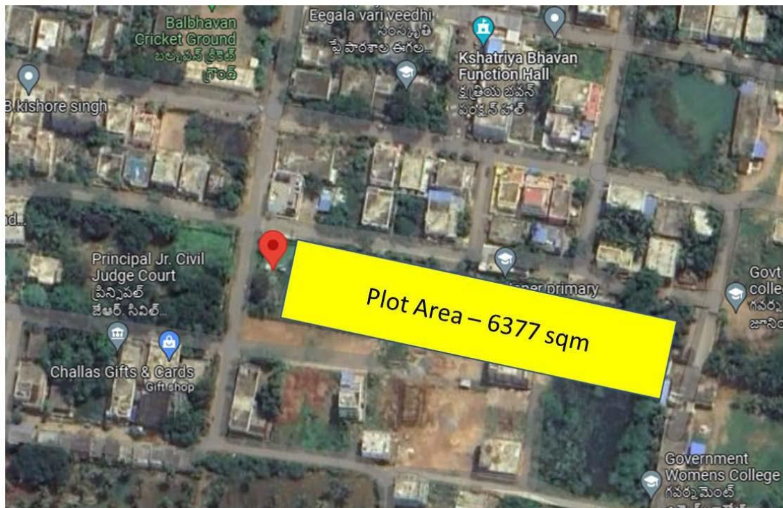
Location of Subject Site

The subject site is situated at 17°21'02.1"N 82°32'38.0"E in close proximity to educational institutions. The site can be accessed by 2 roads. The subject site is located and surrounded by residential colonies. Government Women's College and Upper primary school are near the subject site. A judicial Court is proposed to be developed opposite the site. The subject site is at a distance of approx. 3 Km from NH 16, approx. 4 Km from Tuni RTC Bus Complex, approx. 2.5 km from railway station and approximately 100 Kms from Rajahmundry Airport.